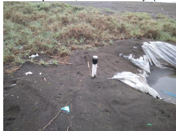
Figure 4. Salt Raw Materials from Underground Wells

Salt farmers in Glempangpasir Village collect seawater by drilling wells on the beach (figure 4), then the water enters the reservoir and passes through the filter in figure 5. The filtering contents in the container consist of solid rock, charcoal, and filter cloth. Next, the water enters the washing tank I (3 BE - 7 BE). Then it flows into tub II (7° BE – 12 BE). After the water reaches (12° BE - 17 BE), it flows into tub III. If the water has reached (17° BE - 23 BE), it flows into tub IV and the finishing tub when it reaches (23° BE - 25 BE) until the water starts to crystallize. Degree BE or Baume is a scale for measuring the density of liquids heavier than water and other scale tools. (Besttekin, 2017). The processing of seawater into the salt with the Tunnel system is faster than with other systems because it takes about 28 days when it is the rainy season. However, the salt harvest can be even faster in the dry season, around 15-20 days (Joesidawati, 2019).