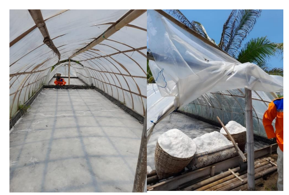
Figure 3. Salt Results from the Tunnel System are whiter and cleaner

Salt farmers in Glempangpasir Village collect seawater by drilling wells on the beach (figure 4), then the water enters the reservoir and passes through the filter in figure 5. The filtering contents in the container consist of solid rock, charcoal, and filter cloth. Next, the water enters the washing tank I (3 BE - 7 BE). Then it flows into tub II (7° BE – 12 BE). After the water reaches (12° BE - 17 BE), it flows into tub III. If the water has reached (17° BE - 23 BE), it flows into tub IV and the finishing tub when it reaches (23° BE - 25 BE) until the water starts to crystallize. Degree BE or Baume is a scale for measuring the density of liquids heavier than water and other scale tools. (Besttekin, 2017). The processing of seawater into the salt with the Tunnel system is faster than with other systems because it takes about 28 days when it is the rainy season. However, the salt harvest can be even faster in the dry season, around 15-20 days (Joesidawati, 2019).