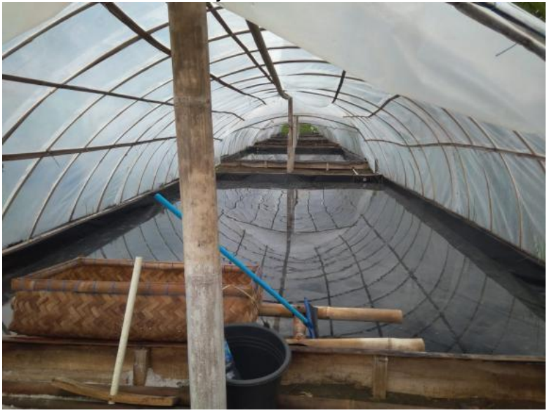
Figure 2. Salt Pond with Tunnel System

Glempangpasir Village, Adipala District, Cilacap Regency, Central Java Province, is one of the centers for local-scale salt production. In the future, it will become a national scale. Salt farmers in this village have implemented the Tunnel system, the process of making salt that is carried out securely, starting from the natural water process from the sea to old water, which ends at the crystallization table (Dzikunoo et al., 2021). This system is proven to produce salt with better quality, white, and cleaner (Hao et al., 2021). Figure 2 is a salt farmer's pond with a Tunnel system. Figure 3 shows the results of the Tunnel system in the form of whiter and cleaner salt.