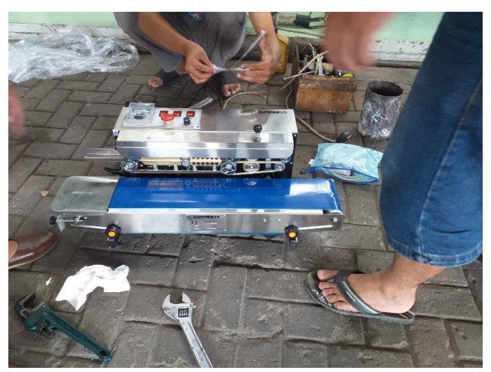
Figure 6. Modern Automatic Salt Packaging Machine

The following is a modern automatic salt-packing machine.